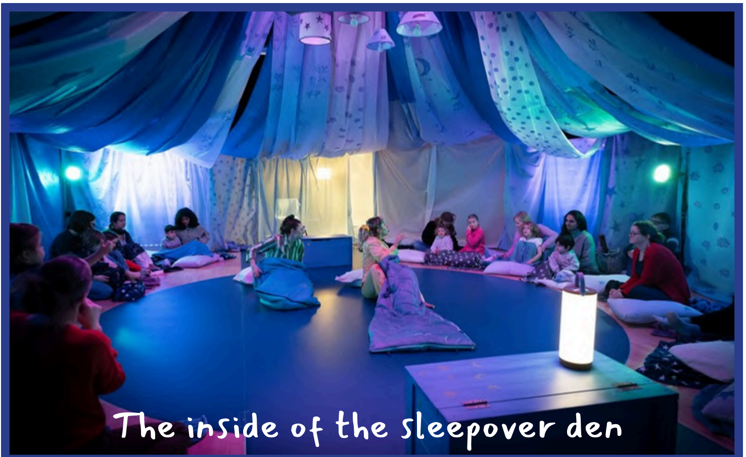
The inside of the sleepover den